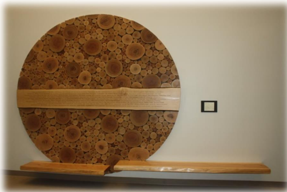
Art is Expressed in the Details