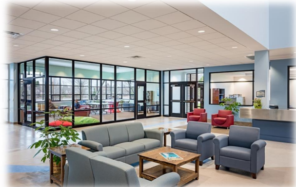
Lobby Gathering Space