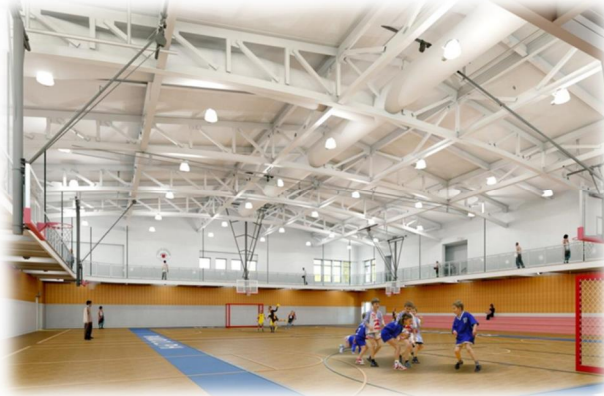
Multipurpose gym & raised track