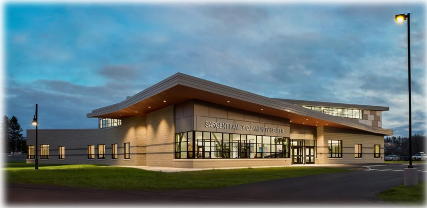
The Approach and Entrance

30,000 ft 2 facility has a gymnasium, walking track, Senior Center with kitchen, Teen Center and a multi-purpose room. The SFCC is the Recreation & Parks Department's home base where a variety of programs and activities are available for all ages throughout the year.