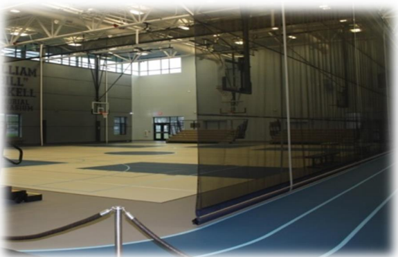
Flexible Gymnasium Space with Indoor Walking Track