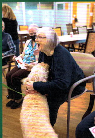
Therapy dog, Phern, spreads joy every Friday at SMAA's Adult Day Program in Biddeford.