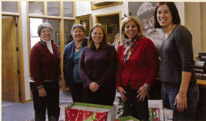
Commercial Properties is On Board Again!

A warm coat, socks, a turkey, games, books, housewares—a little goes a long way for one child, teen or adult with special needs. It's not too early to sign on.