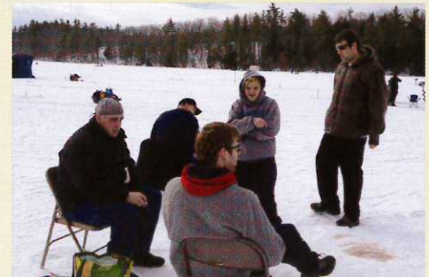
Expeditions team participating in fishing tournament last winter