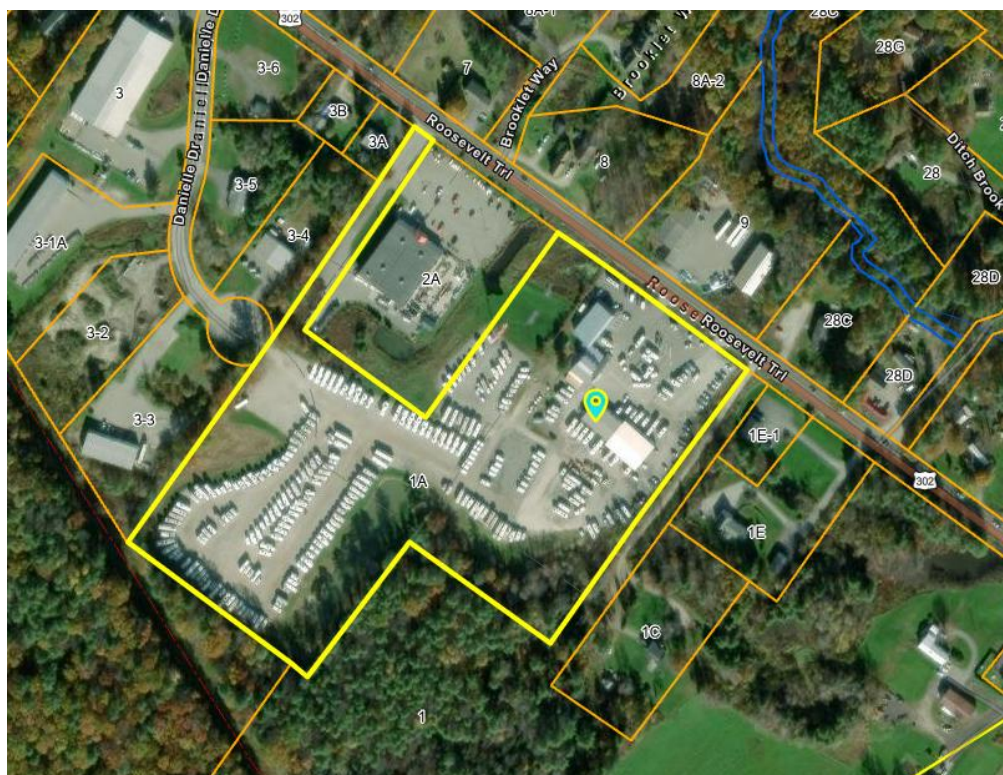
Figure 1. Aerial view of the subject parcel relative to surrounding properties and street network.

Uses: Retail Sales, Outdoor; Retail Sales; Automobile Repair Services. Subject property is identified as Tax Map: 15: Lot: 1A; Zone: Commercial III (C-3) in the Ditch Brook watershed.