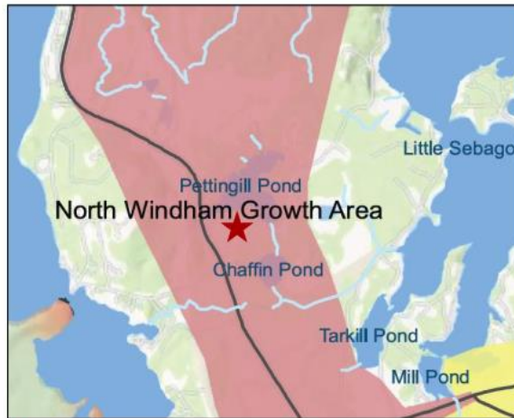
★ Site of proposed zone change from Farm to C4

infrastructure and facilities should be located. The Rural Areas are places where future development is to be directed away. The C-4 District will help transition to more intensive land uses from rural areas of town.