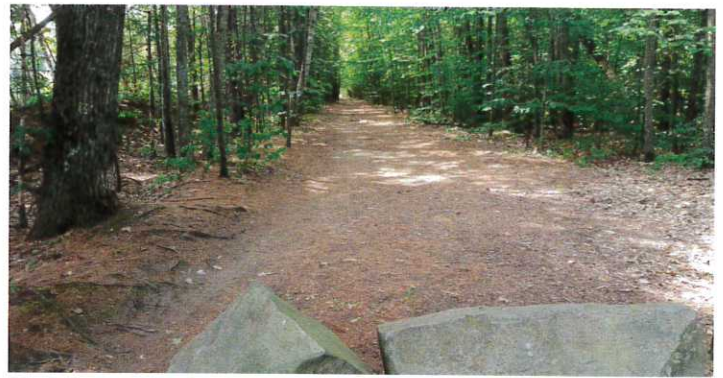
Frazier Preserve Trail adjacent to Gorham High School