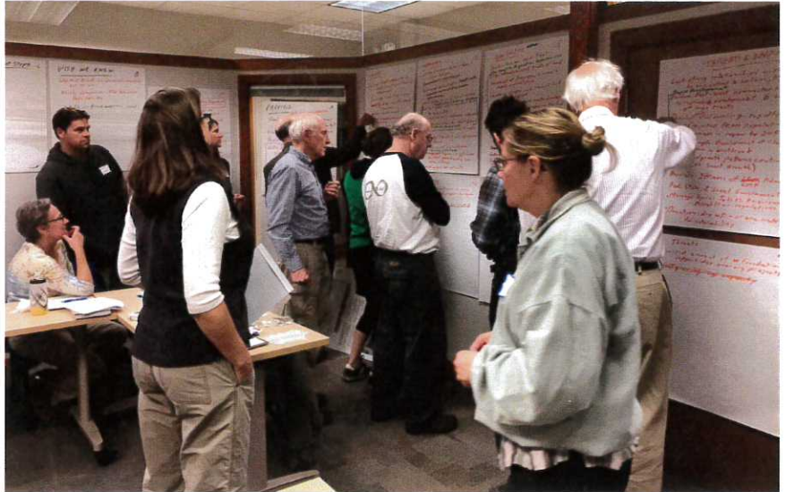
Strategic Planning Retreat with Board and Committee Members

We asked open-ended questions to find out what are the biggest community concerns and how we can provide greater service to the region to address community concerns below is the summary.