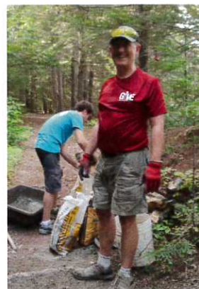
Trail work volunteers

We host an outreach event at our preserves every month, and we can use help with setup and logistics such as checking people in, directing parking, or taking pictures during events.