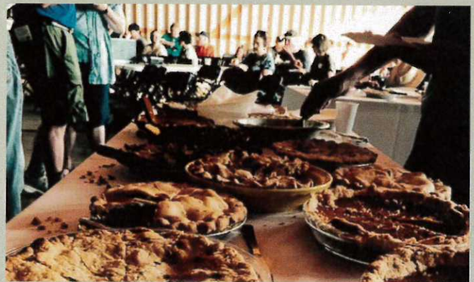
Our 2017 Annual Meeting at Randall Orchards