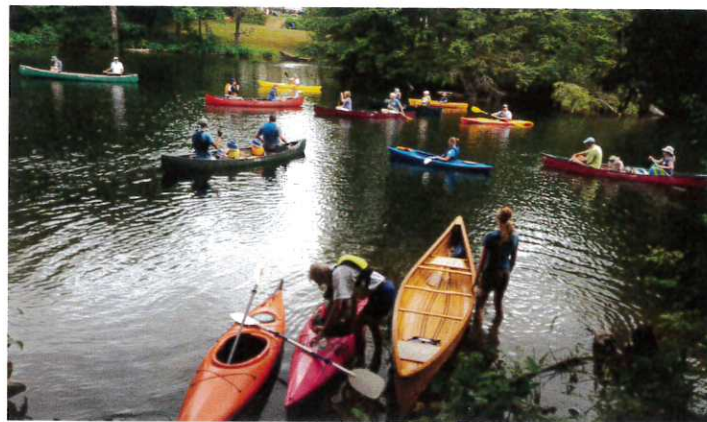
Paddling the Presumpscot event at Hawkes Preserve August 2017

Maine Medical Center Margaret E. Burnham Charitable Trust Nappi Distributors Pierce Atwood Sewall Foundation Town of Gorham Vienna Farm Westbrook Trailblazers Westbrook Environmental Improvement Corp Westbrook Recreation and Conservation Commission Windham Watershed Protection Grant United Way UNUM