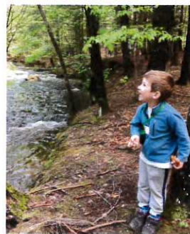
Sustaining Nature for the Next Generation

Sustainers provide critical leadership support needed to sustain our mission to conserve, steward, access and enjoy local lands and clean water for the benefit of current and future generations.