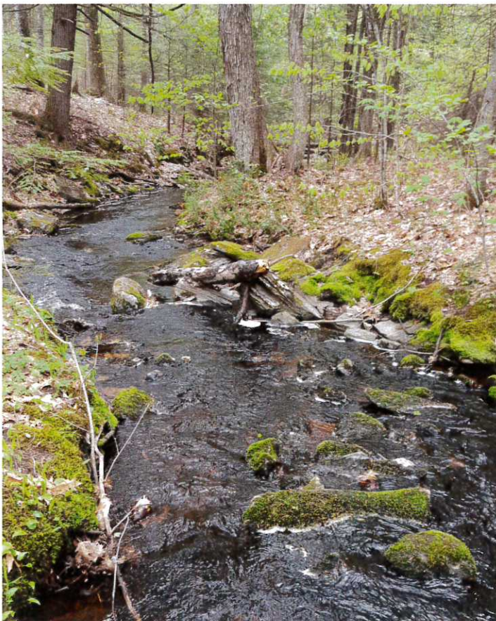
Our new conserved land along Nason Brook in Gorham