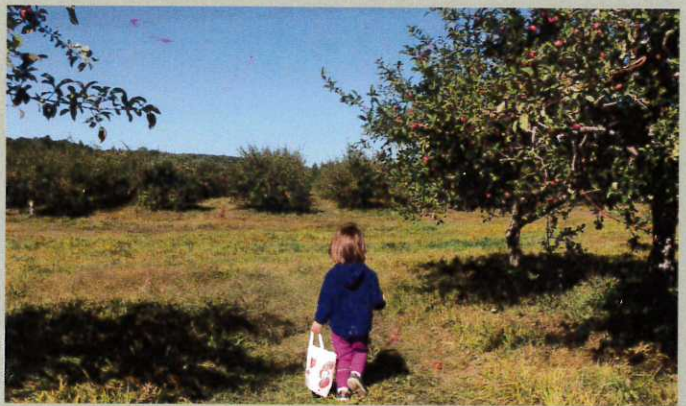
Apple picking at Randall Orchards

Thirty years ago, Maine voters overwhelmingly approved a bond to purchase lands of significance for recreation and conservation, such as Black Brook Preserve and Randall Orchards. Since then, Land For Maine’s Future Program has helped to protect more than 600,000 acres of land in Maine for us – forever. This program is vital because Maine has the lowest percent of public land of all states on the East Coast. We expect that in the coming years there will be more significant conservation projects in our region that will only be possible with support from the Land For Maine’s Future program.